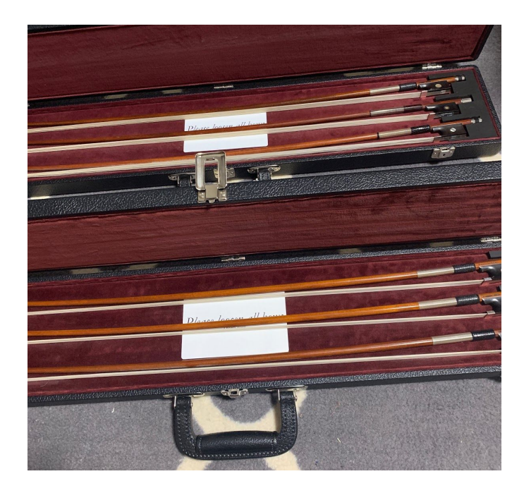
Package of bows from Carriage House. I ended up choosing the bow on the bottom.

sounded with my instrument. It was a very difficult decision as two of the bows both sounded amazing but after researching the manufacturers, we chose a bow that came from a very highly-recommended bow maker to ensure that I picked the highest quality bow that would last me the longest and hopefully require less maintenance and repairs in the future.