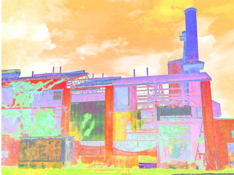
(16mm colorized film still from documentation and distortion project)

Despite the lean towards digital equipment, I did still shoot a good deal of actual film. However, I realized about halfway through that the aesthetic qualities of film weren't well suited for the project of documentation, largely because of the time constraint (one roll of film is only about two minute and twenty five seconds). I plan to turn this footage into another project that focuses on trees as the seasons change. All of the films produced as part of this project will be available on my website, kiawassenaar.com , in the coming weeks.