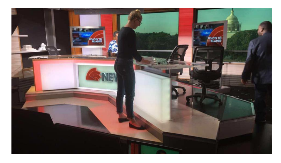
An on set visit at News One Now, TV One's morning news show.

TV One provided a unique work experience because the network is on par with other cable channels, but is smaller and therefore gave me the opportunity to be a participant instead of simply being an observer. My arts courses were especially helpful in this regard. I was able to offer ideas and give informed feedback, as a result of my cinematography and playwriting courses. Some of the scripts that I chose have been produced and aired or are in development.