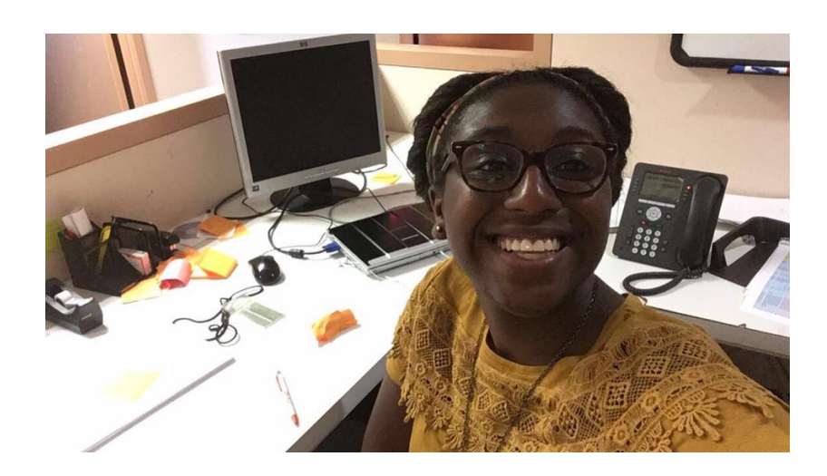
An afternoon at my desk, complete with a stack of scripts.

Specifically, I was an intern in the Original Programming and Production department. In a corporate world, I expected the work style to be very individualistic, however I found that the Original Programming to be an extremely collaborative team. In weekly meetings, producers were constantly bouncing ideas off of one and other, sharing thoughts, and problem solving. I learned most from the business side of their minds, but resonated most with their artistic sides. They sought to speak out about injustices and tell stories that people really care about. This was comforting and gave me a better since of direction for my post-graduation pursuits.