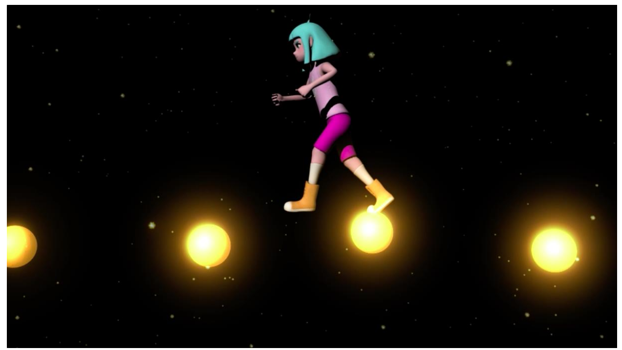
A still from the final project of my animation class. Created in Maya.

However, this minor block did not stop me in my pursuit to learn more filmmaking skills and gain the technology I needed to make my next short film. With the grant money, I bought V-Ray, which is a rendering software for Maya. I used V-Ray to render out gorgeous 3D animations for my Computer Animation and Motion class. I was very proud of my final project in the class, and will surely try to submit my project to other film festivals through the "Animation" category. Below is a still from the piece– an animated, fantastical sequence of the main character jumping on stars. Below it, I added other stunning images rendered using V-Ray– as, without this software, I wouldn't have been able to get the realistic shadows and vibrant colors reminiscent of professionally animated work.