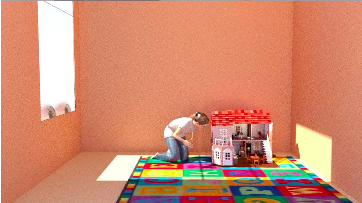
Stills from other short films I made in the class. Rendered using V-Ray.

In addition, I bought a year of access to Adobe Suite. Premiere Pro and Photoshop were absolutely vital to my success in editing together and scoring my animations. I also used these programs in creating scenes for the UVA Drama Dept's production of Love and Information . Without access to these editing programs, I couldn't create such fast-paced, graphic-intense scenes or color-corrected properly (an example seen below).