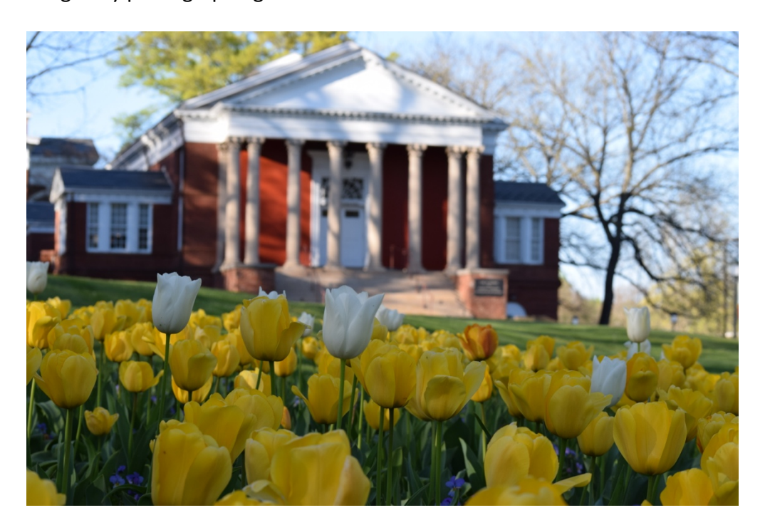
When the school year was over, I photographed Norfolk and Virginia Beach where I reside.