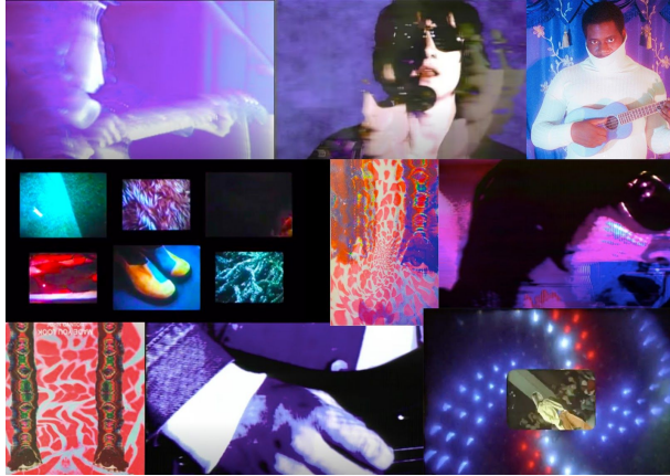
Style selected for the Music Video