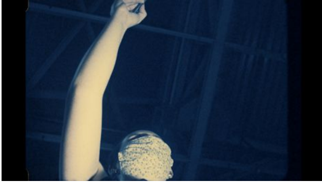
Shot from the Artist in Studio Short