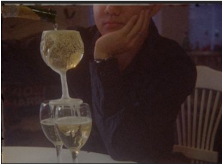
Shot from the fashion piece