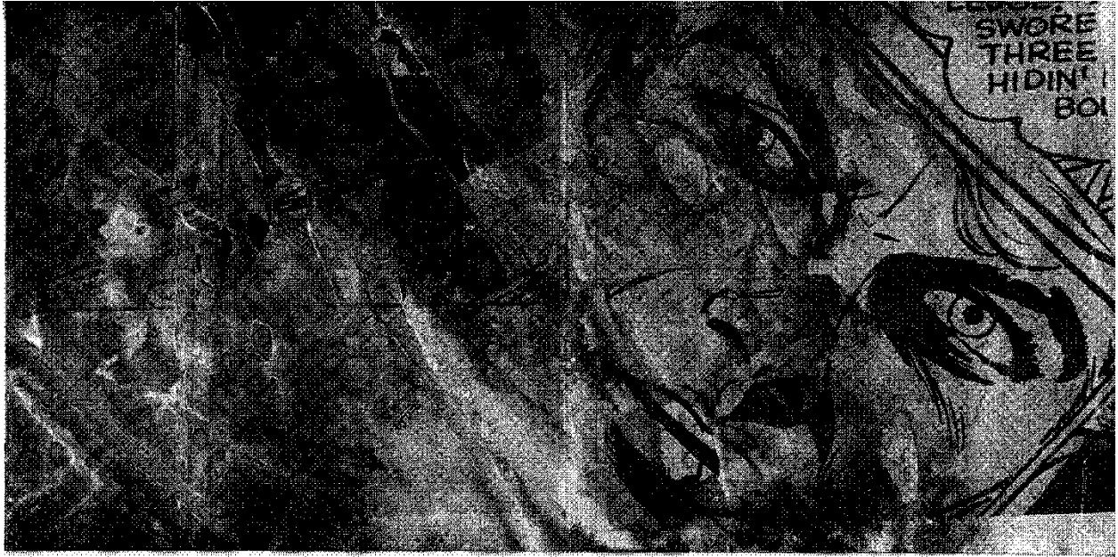
Pioneers for Too Long (Page 8)