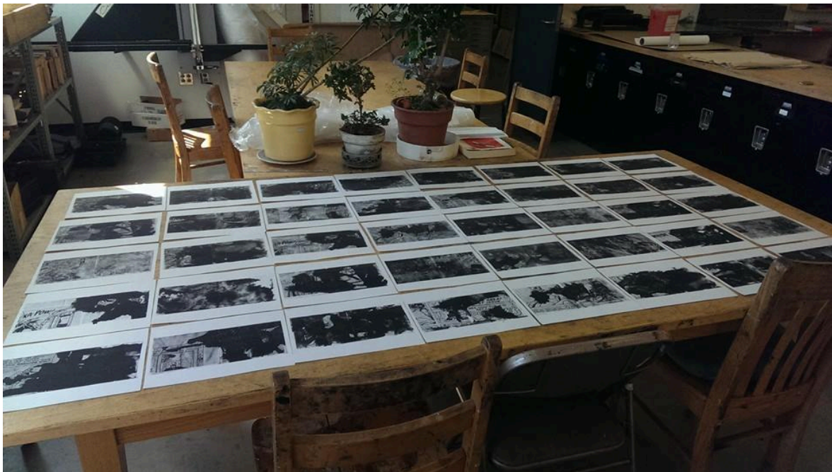
Images in situ in Ruffin Hall