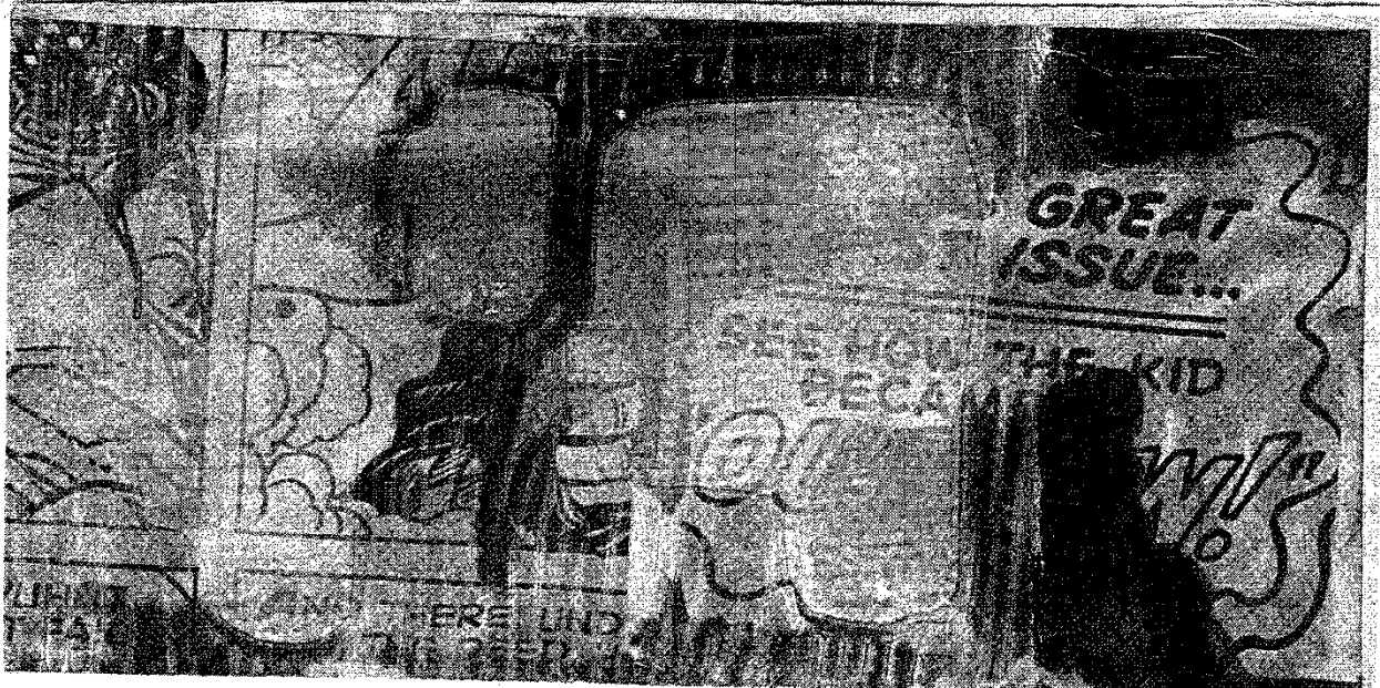
Pioneers for Too Long (Page 1)