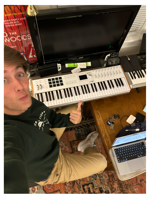
^ Me with the keyboard freshly unboxed in my room at UVA