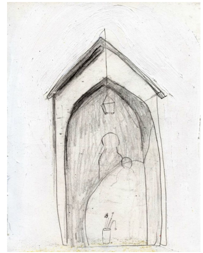
street shrine (Rome)

moment of hyper awareness--when time swells up and the sense of self becomes inseparable from the present surroundings. These ecstatic moments are of a certain suspension, paradoxically both infinite and ephemeral. I allowed myself to work intuitively--stopping at any moment it felt appropriate to draw.