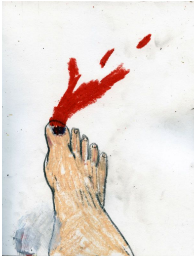
busting my toe (Paris)

I journaled extensively and created a 62-page artist's book over the course of my travels which I have deliberately left untitled. Each page references a separate ecstatic moment of my trip, which I define as a