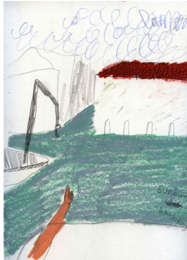
hitchhiking in Venice