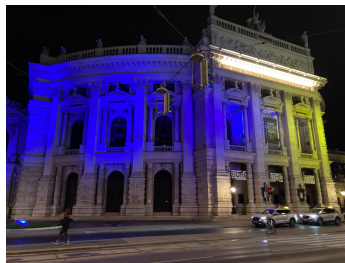
Burgtheatre, 1st District of Wien