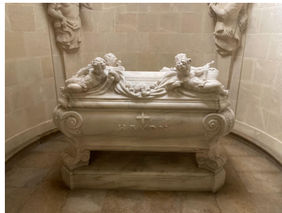
Joseph Haydn's Mausoleum Bergkirche, Eisenstadt