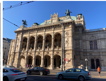
Wien Staatsoper, 1st District of Wien