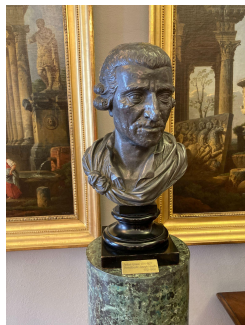
Bust of Haydn (commissioned by Haydn) Schloss-Rohrau