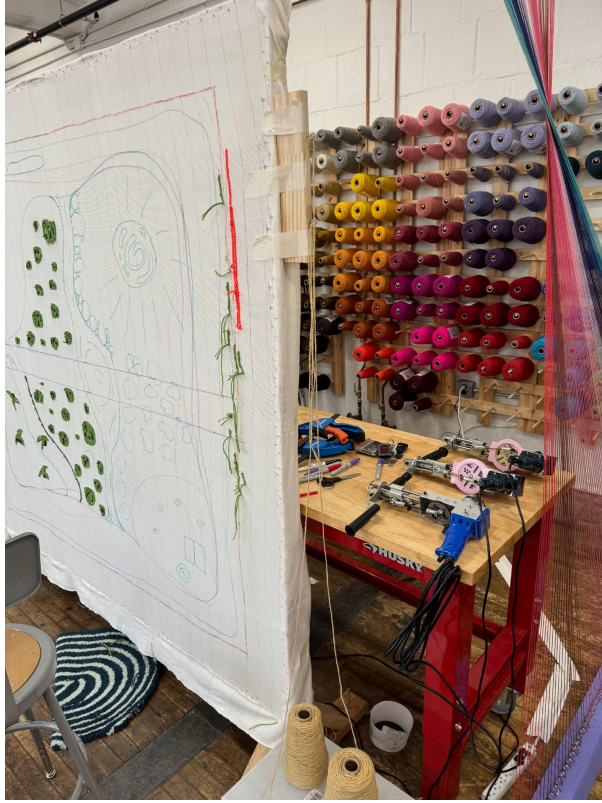
Day one of my summer tufting course