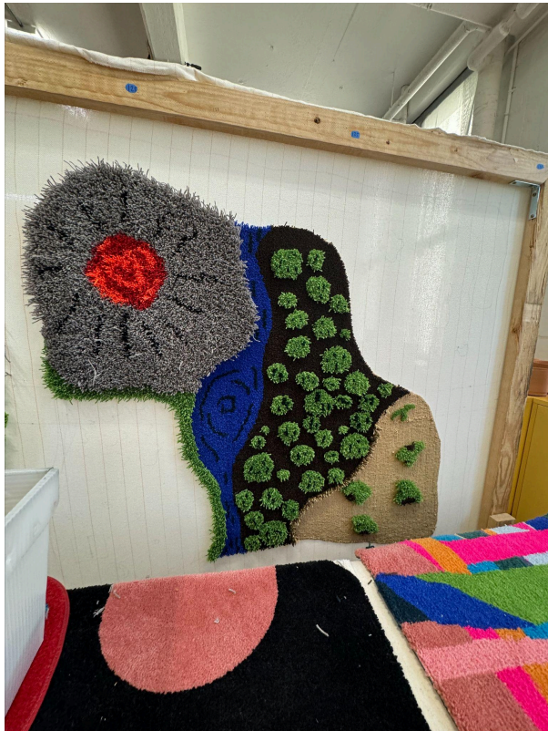
Day two of my summer tufting course