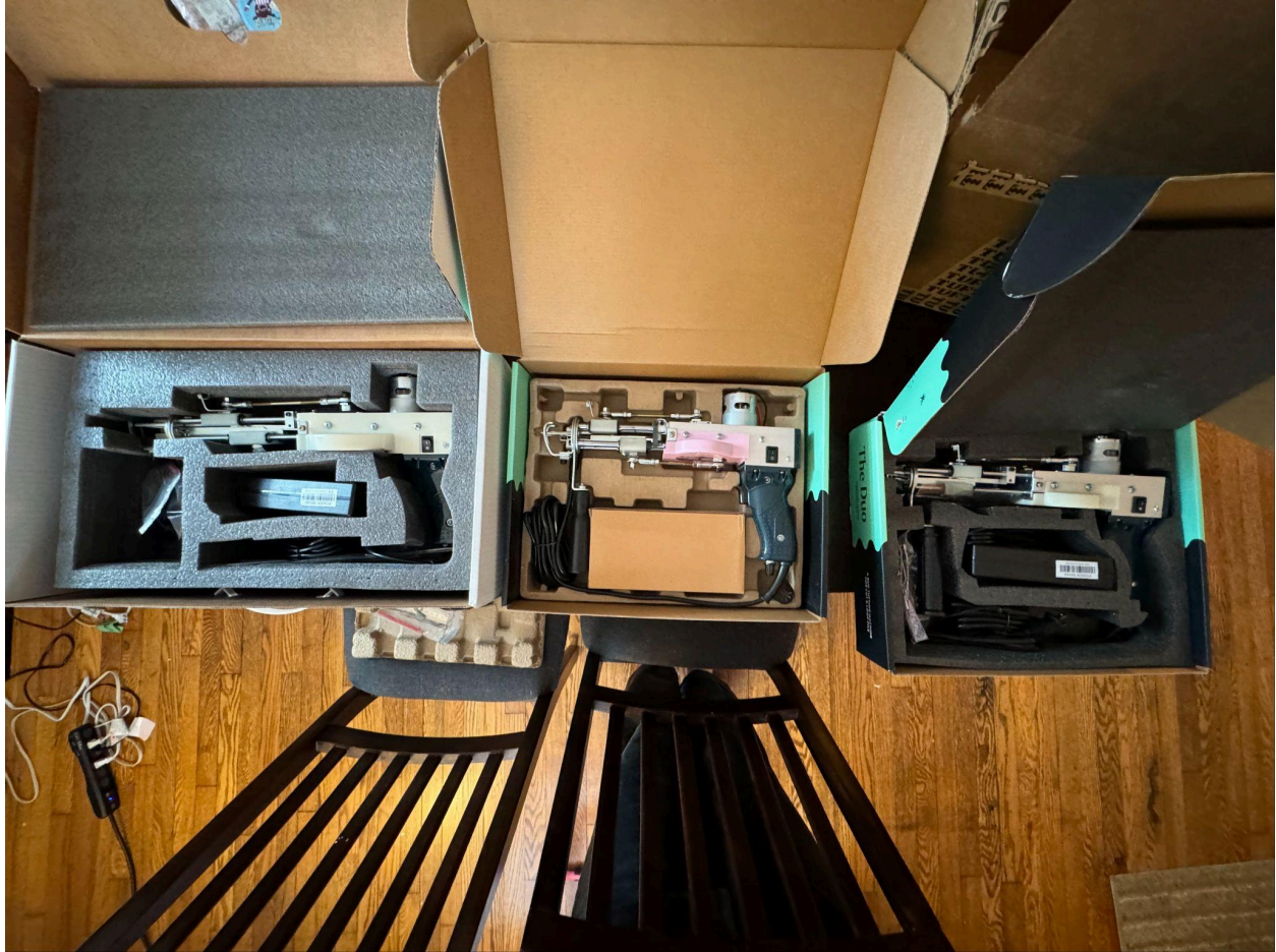
Obtained the equipment to tuft!