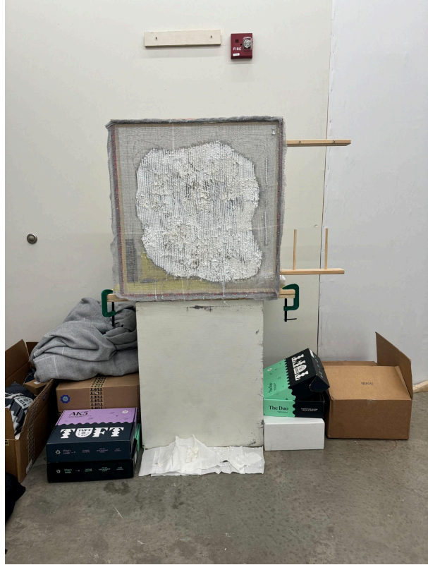
The tufting frame setup in Ruffin