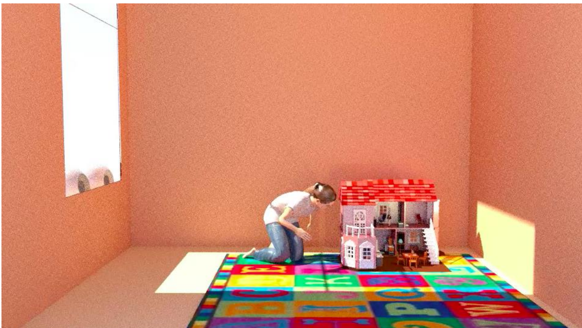
Stills from short films I made in the animation class with Maya. Rendered using V-Ray.

In addition, I bought the software, Final Draft 11 Edu, which is a one-time purchase to write plays and screenplays formatted to the industry standard. With this software, I could write from home and improve my storytelling skills — even finishing a One-Act play that will premiere at the Drama Department’s 2021 New Works Festival! Below is the title and summary.