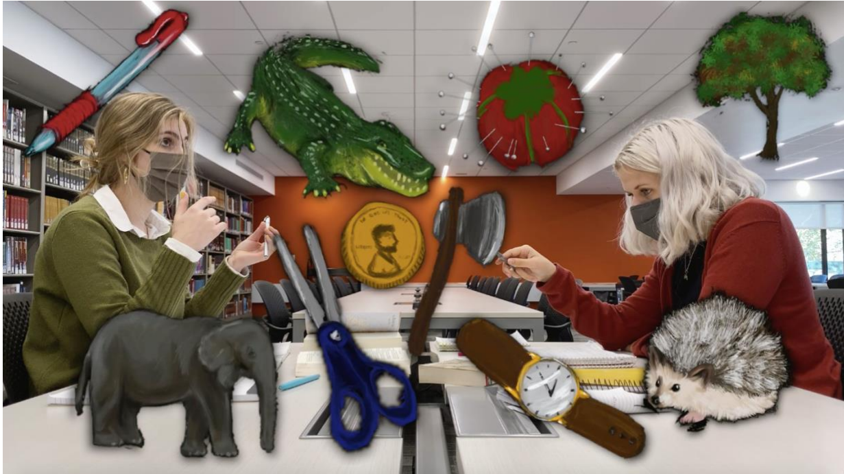
Still from Love and Information. Illustrations drawn using the Apple pen. Editing done using the high-performance Windows PC, monitor, and access to Adobe Creative Suite.