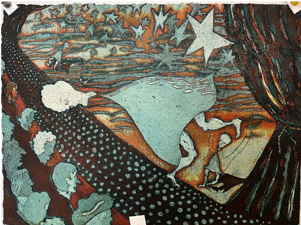
Boiler Fish , simultaneous intaglio print, 9''x12''