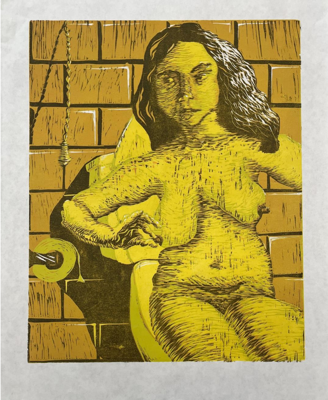
Girl Pinching Nipple on the Toilet , reduction woodcut, 16"x20"