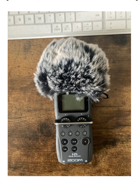
Pictured: The Zoom H5 Recorder, furry attached.

frequent access to a power source and I will continually move around, leading to risk of damage for less durable drives. The Rocket Nano is also only 2.85 x 1.28 inches, making it ultra portable. In addition, having multiple external hard drives acts as a failsafe if one of the drives breaks. I've had experience with losing all of my progress on a musical project in the past because of this problem, so I wanted to avoid a repeat.