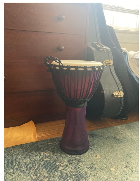
Pictured: The rope-tuned djembe I bought.

Overall, I'm very grateful that for this grant. It has made working in any location easier, enhanced the number of sounds and timbres I could produce, and in