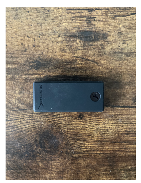
Pictured: The size, speed, and durability of the Rocket Nano SSD made it the ideal hard drive purchase.

Unallocated budget also rose from other sources. Repairing my computer screen at a local shop was significantly cheaper than going to an Apple store, and certain discounts such as Black Friday and student price cuts meant items like the SoundToys 5 Plugin collection ended up being cheaper than expected. This totaled to around $1190.28 of grant money no longer allocated to specific items.