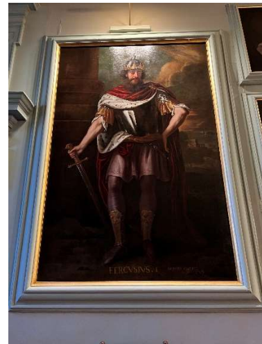
From Holyrood Palace – a potential Ferguson ancestor!