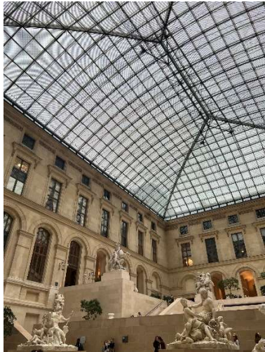
From my visit to the Louvre – a lifelong dream!