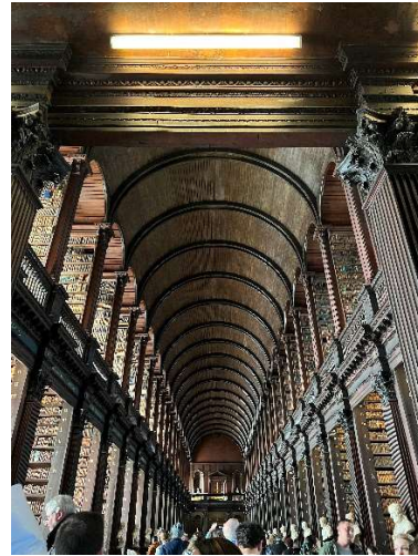
From the Book of Kells in Dublin