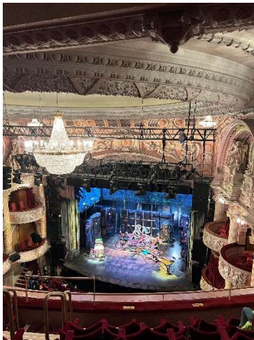
The set for &Juliet