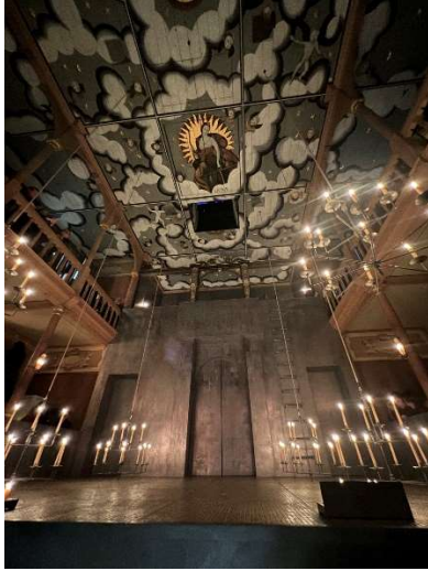
The Globe – where I saw The Merchant of Venice