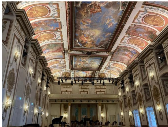
Concert Hall at Schloss Esterhazy