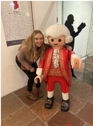
Lego Mozart at the Mozart Wohnhaus