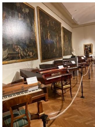
Welk Museum Antique Pianos