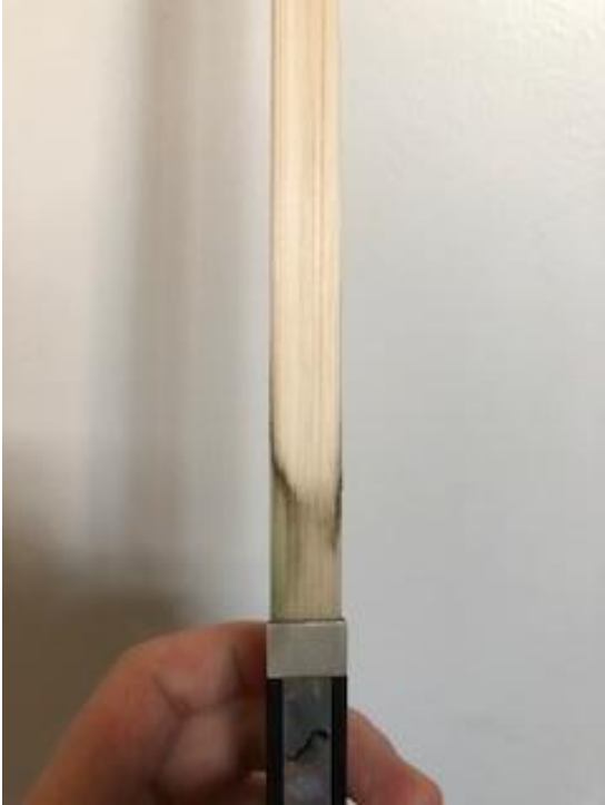
Exhibit 3: The bow hair discoloration indicates that a re-hair is necessary