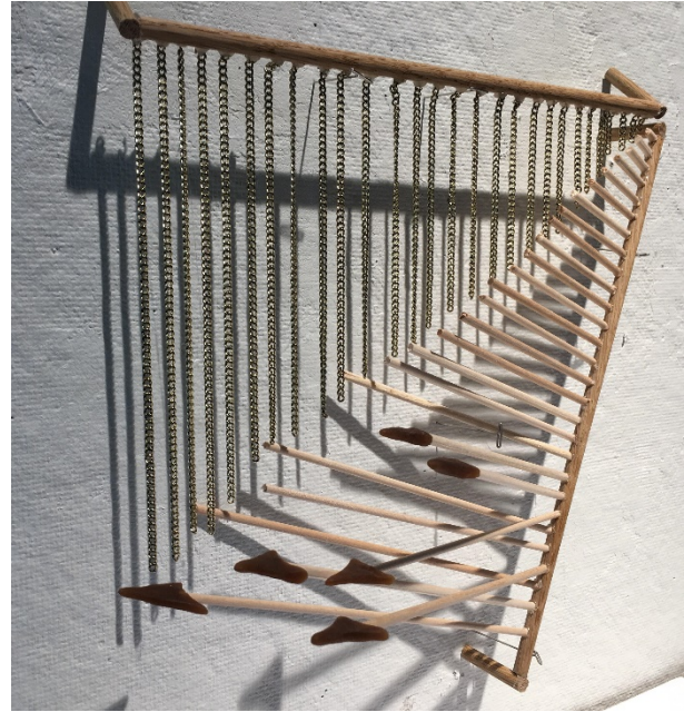
1 in to 1 ft Model